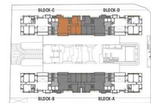
PENTHOUSE UNIT PLAN 5B 2HK + LOUNGE (LOWER LEVEL)