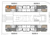
PENTHOUSE UNIT PLAN 5B 2HK + LOUNGE (UPPER LEVEL) WITH SERVANT ROOM