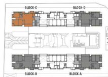
PENTHOUSE UNIT PLAN 5B 2HK + LOUNGE (LOWER LEVEL) WITH SERVANT ROOM