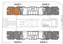
TYPICAL UNIT PLAN 4B 2HK