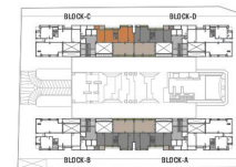
PENTHOUSE UNIT PLAN 5B 2HK + LOUNGE (UPPER LEVEL)